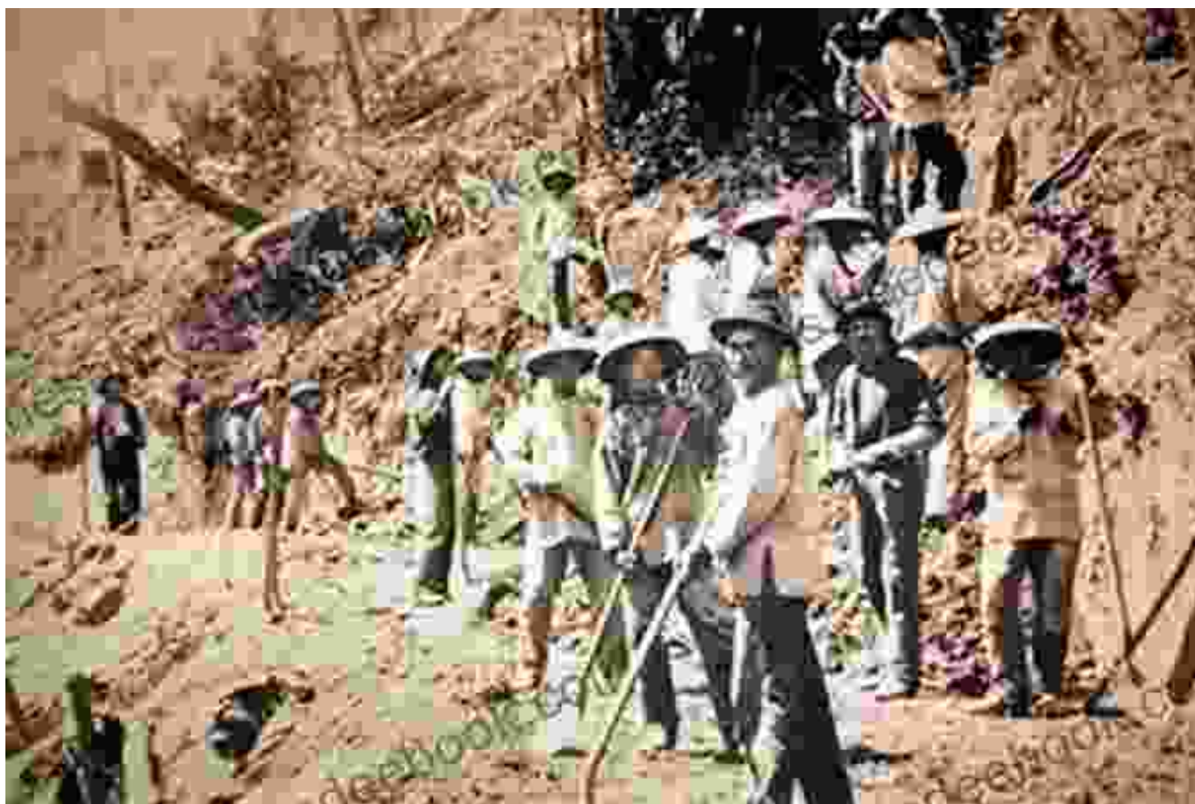
Chinese laborers working on the Transcontinental Railroad

These early immigrants faced numerous challenges, including racial prejudice, discriminatory laws such as the Chinese Exclusion Act of 1882, and internment during World War II. Despite these obstacles, they persevered, establishing thriving communities and contributing to the economic and social fabric of their adopted country.