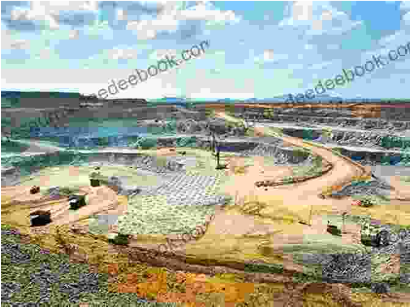
The Platinum Road is lined with mines, smelters, and refineries.